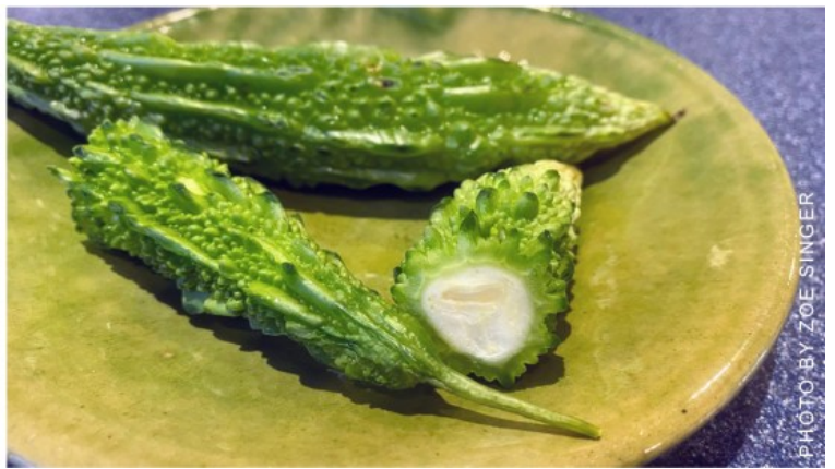
Bitter melon, umeboshi paste, and oyster mushrooms.