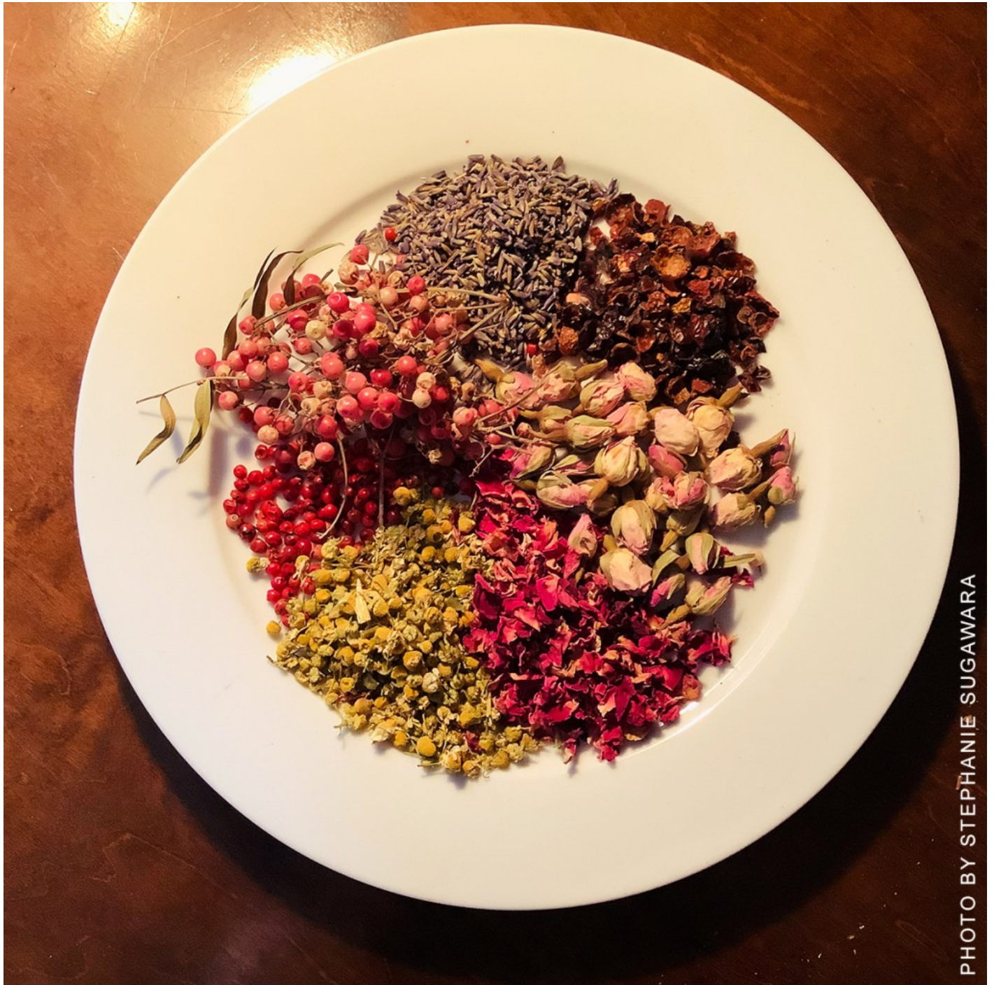
Dried flowers, teas, and spices.

Meanwhile, members Chris Esposito and Leah Schwartz were all in on mushrooms. They grow mushrooms at home and were buying big oyster mushrooms destined for a delicious-sounding frittata as well as shiitake mushrooms to make into vegan bacon—and they kindly shared both recipes below.