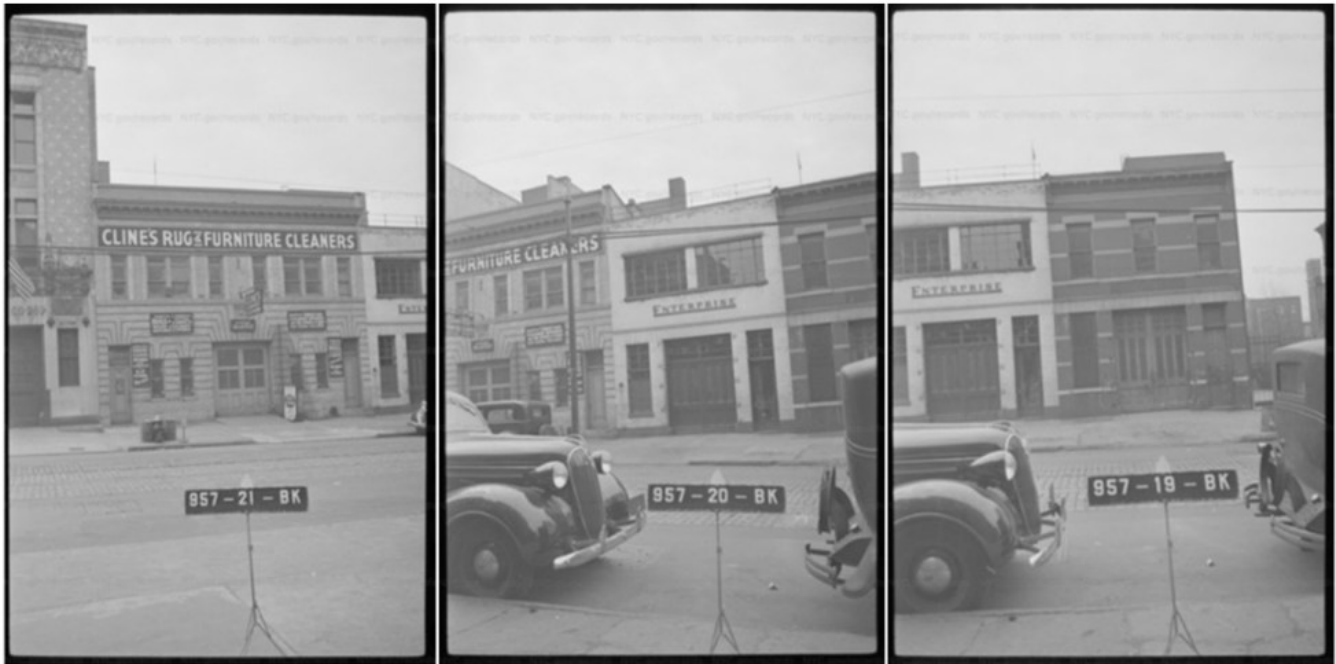
PHOTOS FROM CITY TAX RECORDS

(Figs 3-5): City-wide tax photographic records of 780, 782 and 784 Union St. 1939-1941