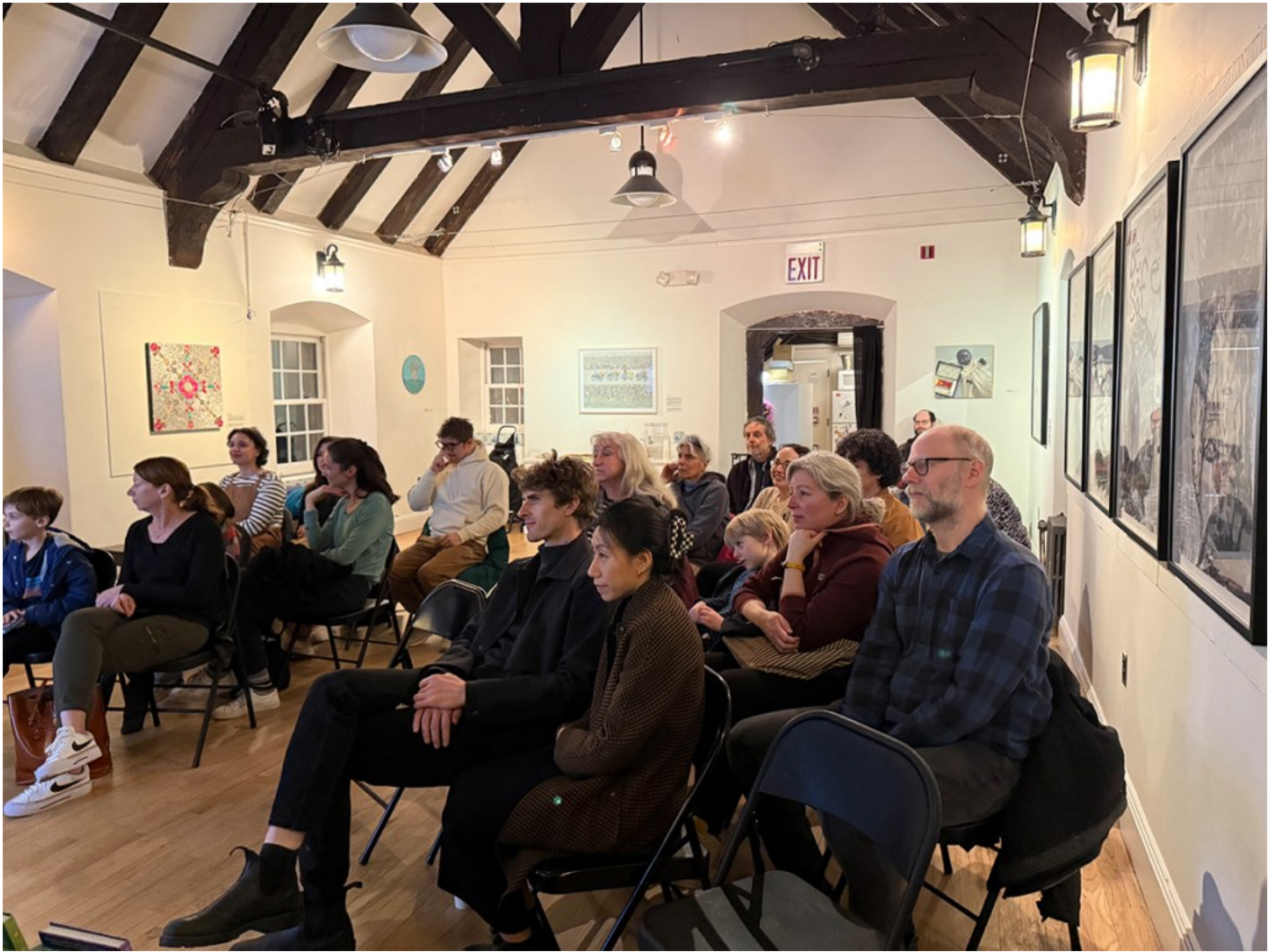
Recent WordSprouts event at the Old Stone House

WordSprouts is a long-running PSFC author series, where Coop authors share thoughts about their works and process. To get updates about WordSprouts events, check the Linewaiters' Gazette or sign up for the WordSprouts mailing list at psfcword-sprouts@gmail.com .