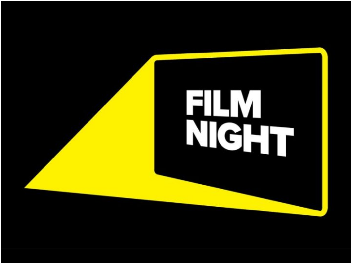
Illustration by Valeria Trucchia