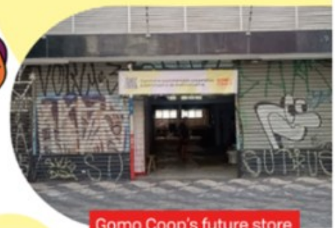
Gomo Coop's future store under construction