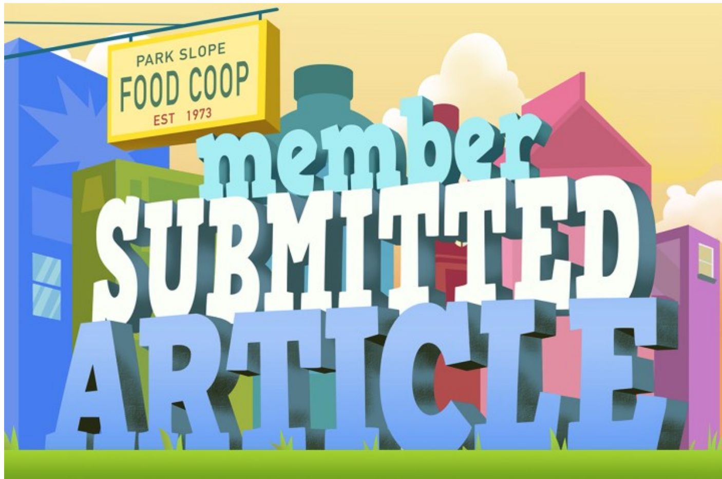
Illustration by Olexa Hewryk