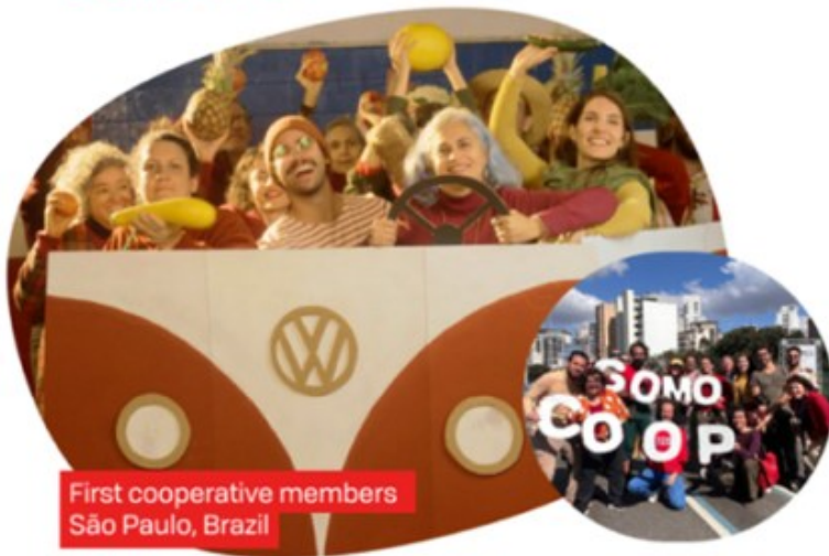
First cooperative members São Paulo, Brazil

Inspired by Park Slope Food Coop , in the last 10 years, many food coops have been founded in Europe. And now it's Brazil's time.