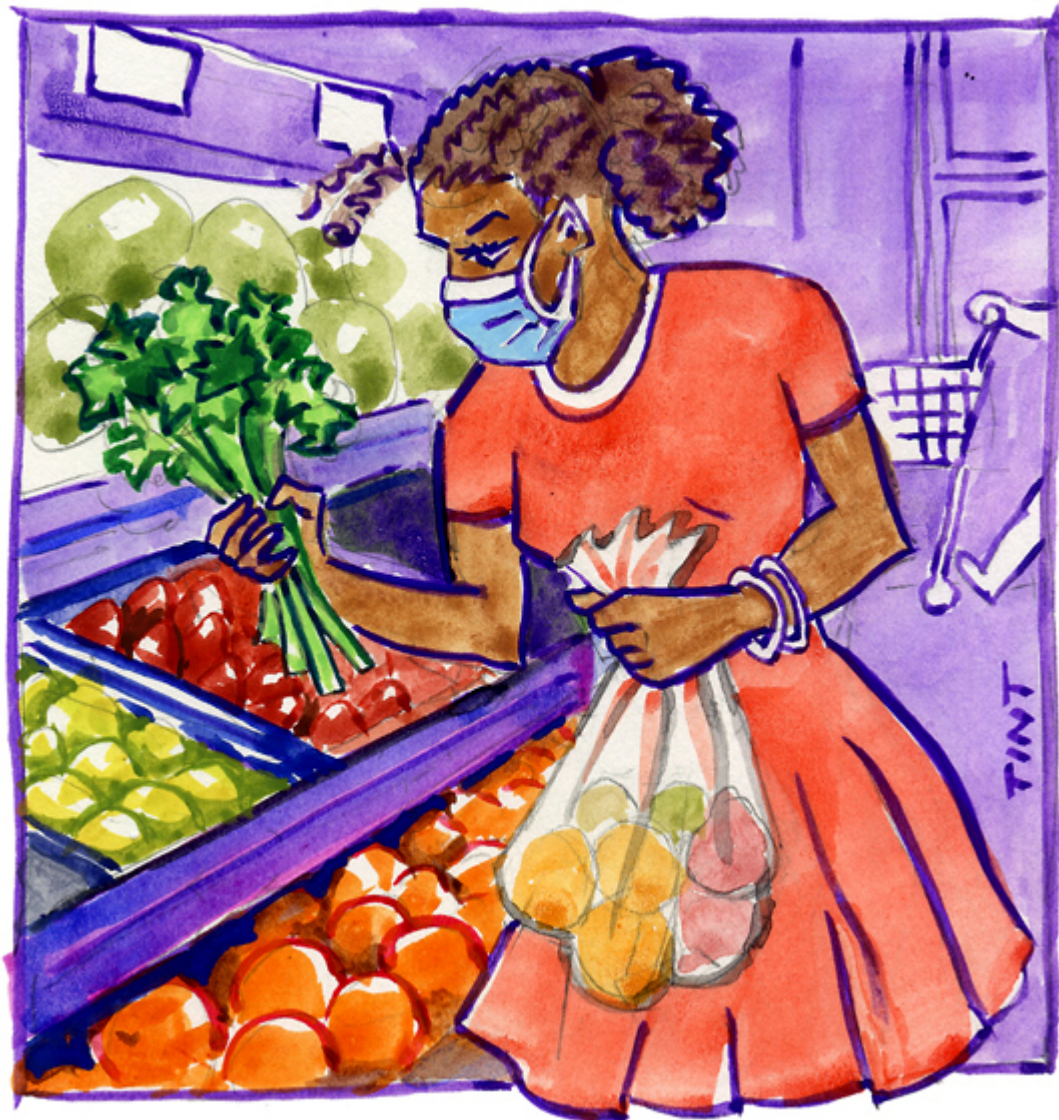
Illustration by Deborah Tint

After pandemic precautions put in place this spring at the Coop, sales fell through the floor, with transactions dropping 79 percent and overall dollars spent down 37 percent for the week ending April 26. A typical week would have shown 17,000 transactions and perhaps $1.1 million total purchases—but only 3,436 took place, albeit at about triple the dollar-value per transaction.