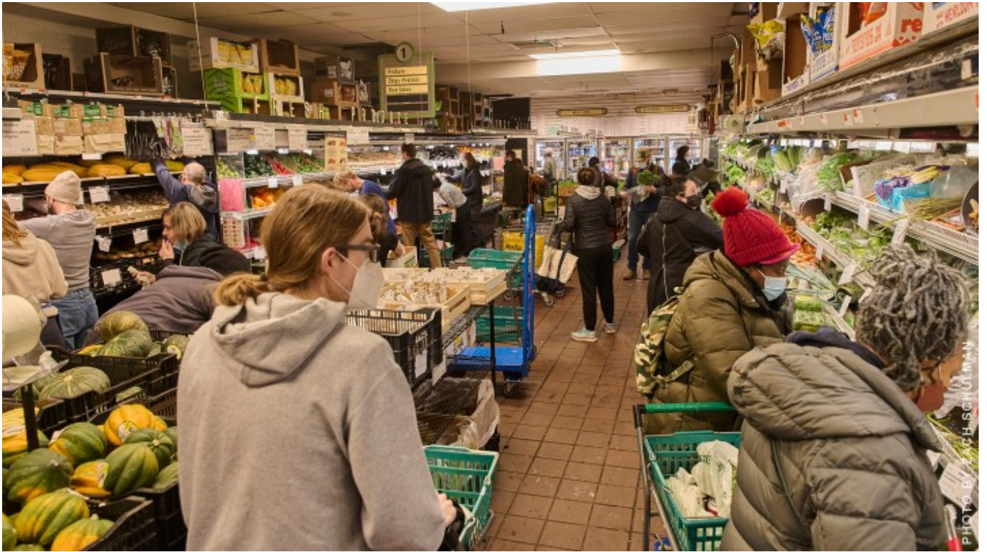
By Zach Schiffman