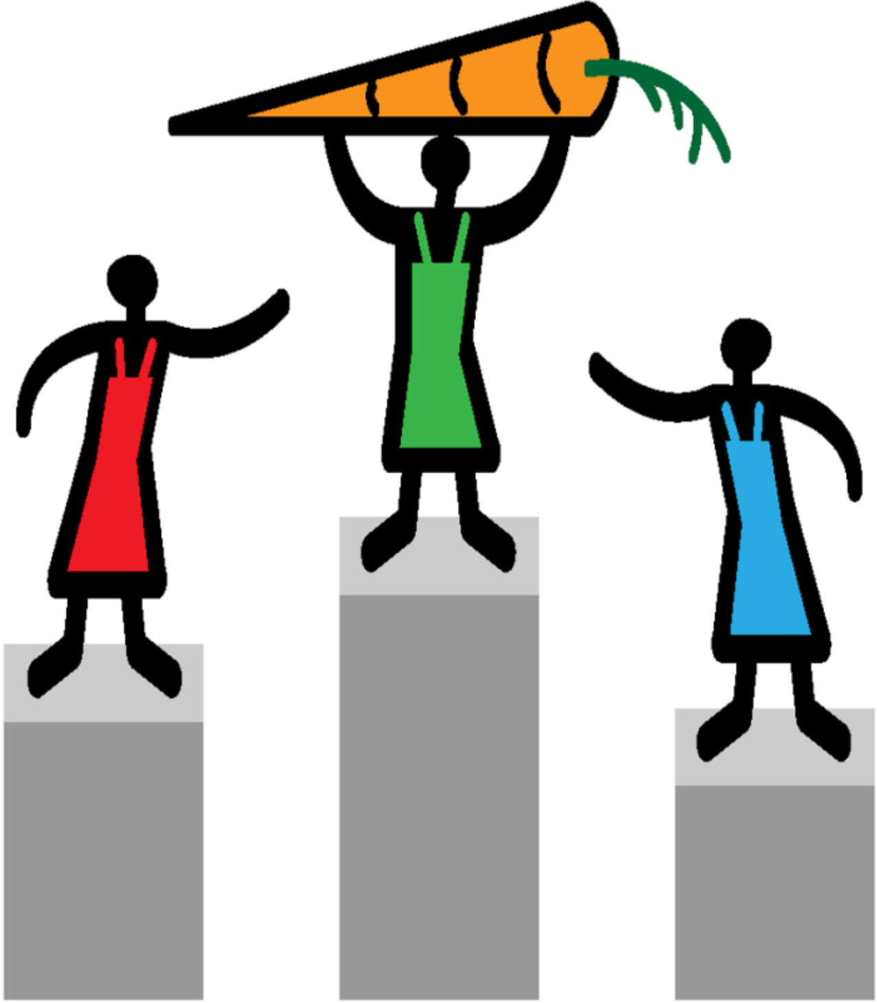
ILLUSTRATION BY STEPHEN SAVAGE