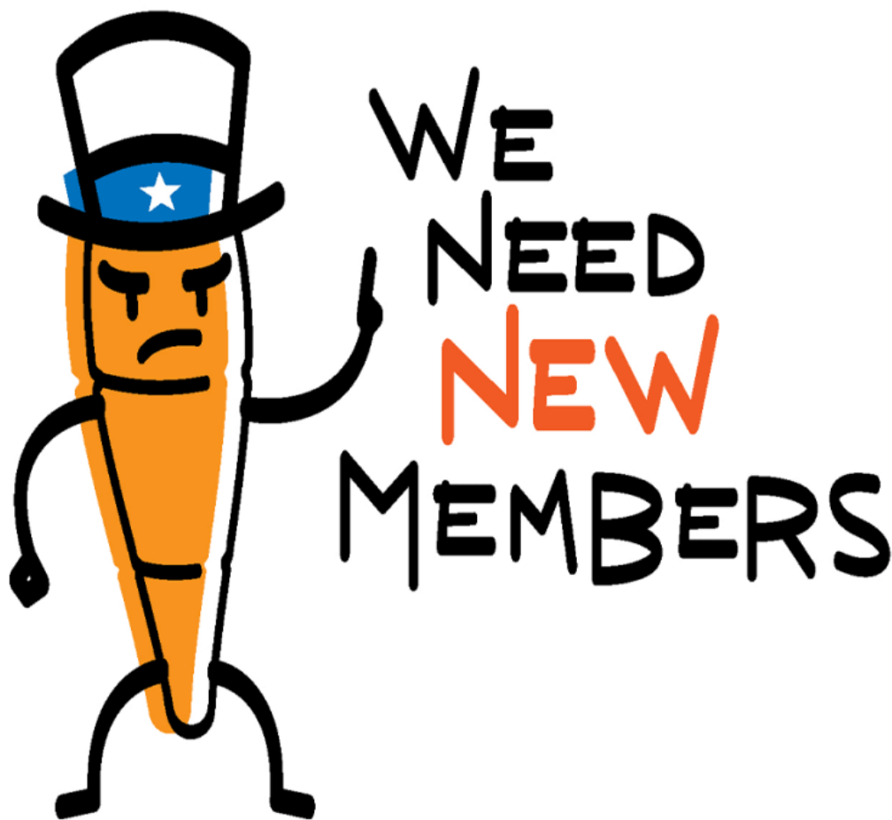
ILLUSTRATION BY STEPHEN SAVAGE

It is estimated that adding another 500 members would bring roughly $1.8 million in additional annual revenue.