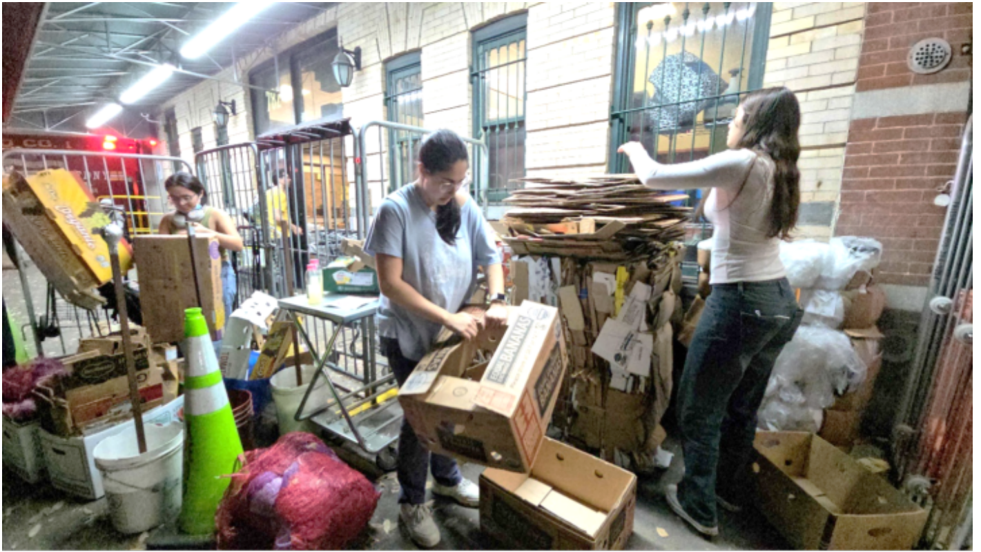
By Tim Shields