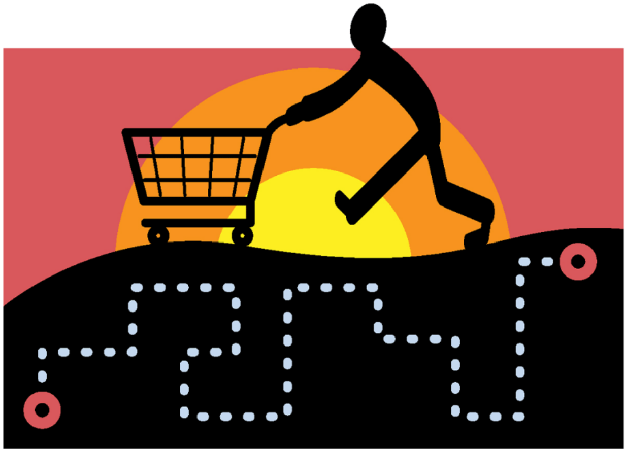
ILLUSTRATION BY STEPHEN SAVAGE

The Coop can often feel overcrowded, with shoppers jostling one another and the entry line flowing up the street. At the same time, membership size is still below pre-2020 levels—a decrease brought about by the pandemic—despite significant efforts to increase efficiency.