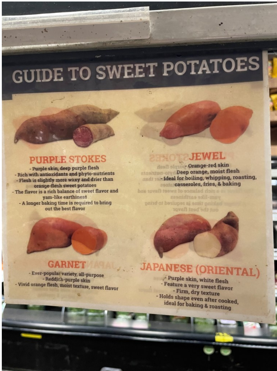
Image of a photograph depicting an infographic hanging in the produce section at the PSFC that illustrates the various sweet potatoes known to be carried at the Food Coop. 23 January 2023

I'm not submitting an opinion against printed materials. Instead, I want to promote the Gazette expanding as a digital knowledge base boasting domain expertise and transparency. The fifth principle of cooperation's focus on education can be interpreted as a reminder that knowledge sharing is a critical element of community. And a knowledge base enables our sharing. Sharing is more than workshops upstairs or on Zoom. Where's the playbook for a successful second location; how do we offboard executive decision-makers; can we inform new members what is an "end-cap" and