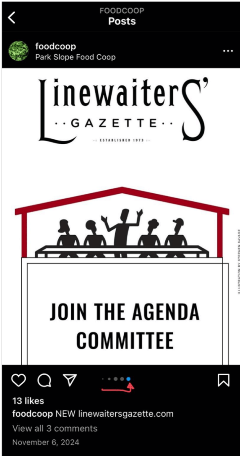
Image of a screenshot showing Instagram @foodcoop account's post driving traffic to Linewaiters' Gazette with a visualization of the Agenda Committee's call for nominations, 06 November 2024

Performing due diligence during a meeting, on an iPhone 15, isn't ideal. Do you use the Gazette's Table of Contents—i.e., the Committee Info section? Do you go post to post, using the left/right buttons at the bottom of the page? Do you leverage the tags